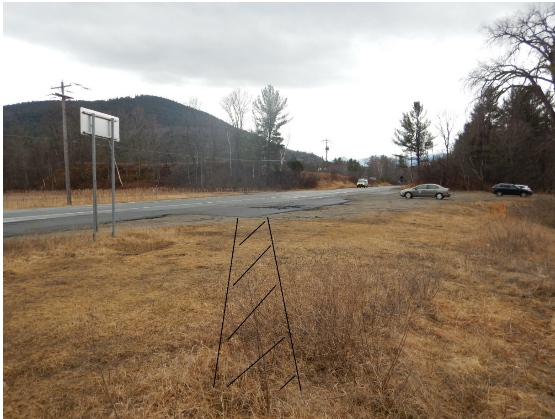
Photo 3: Paved pathway drawing, as seen from the proposed viewing area.